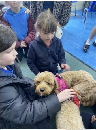
Rocky Ruby Rolo

Rolo has loved being with the Year 2 blue card winners this week!